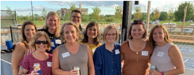
2019 Des Moines Happy Hour