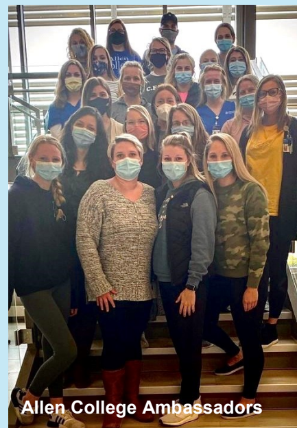
Allen College Ambassadors

Using their firsthand experiences and leadership, the Ambassadors organized to own the moment and support their peers.