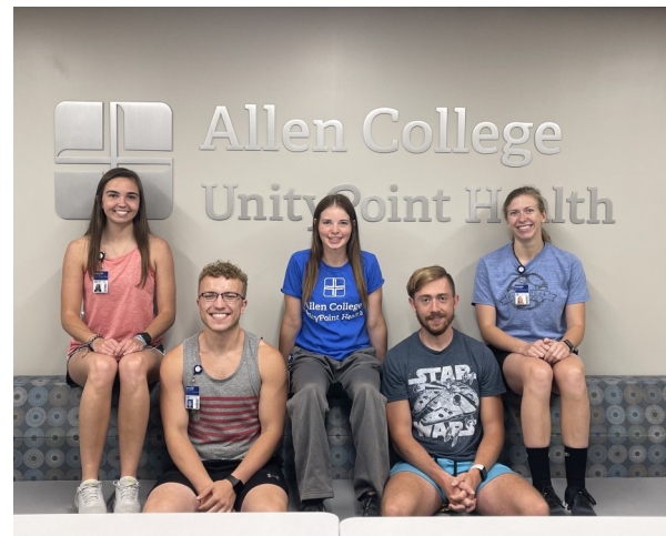
1st class of Allen College physical therapy students