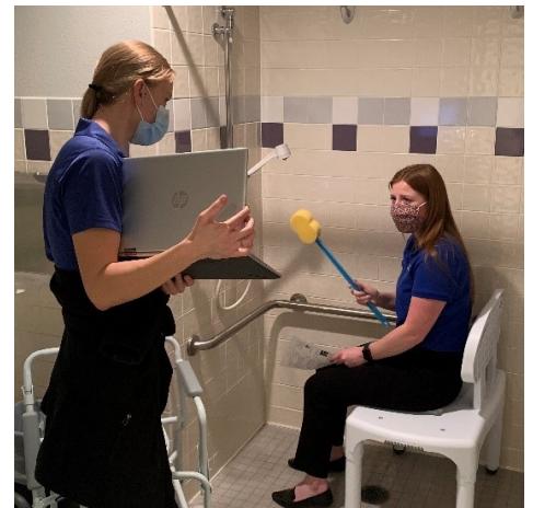
MS in OT students provide education about safe modifications for the bathroom

Second year MS in OT students collaborated with students from the speech language pathology (SLP) program at the University of Northern Iowa and the respiratory therapy program at Des Moines Area Community College to provide a virtual caregiver learning lab in March of 2021. Students had the opportunity to advocate for caregivers, provide education and observe interprofessional interventions.