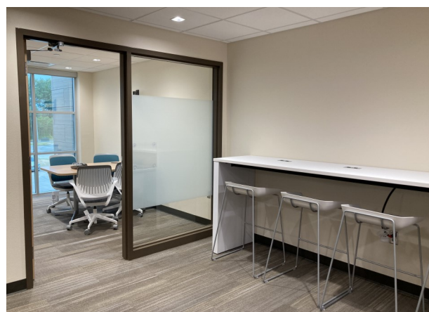
Some of the collaborative spaces and one of the conference rooms are shown in the pictures.