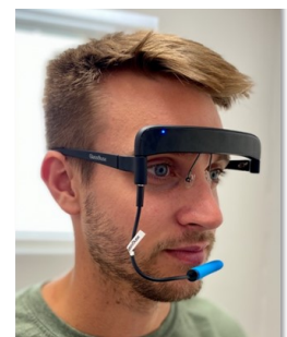
MS in OT student demonstrates use of GlassOuse device to access a computer

These interprofessional events provided opportunities for students to apply classroom knowledge, gain insight from working with members of the community, learn from students in other disciplines and meet the needs of the community.