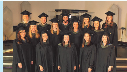
First graduates from the Master of Science in Occupational Therapy Program