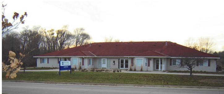
Alumni Hall—renovations were paid in part by donations from the Allen College Alumni Association