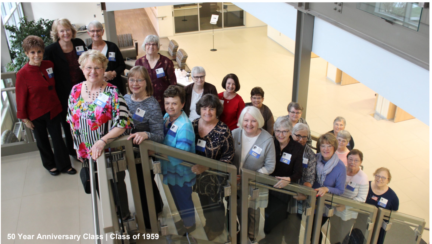
50 Year Anniversary Class | Class of 1959