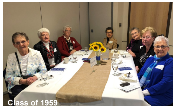
Class of 1959