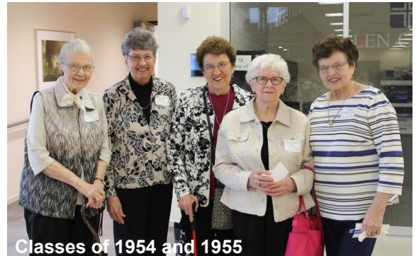
Classes of 1954 and 1955

The 2020 Alumni Reunion will be held in spring 2020. Please be on the lookout for the date in future publications and plan on attending.