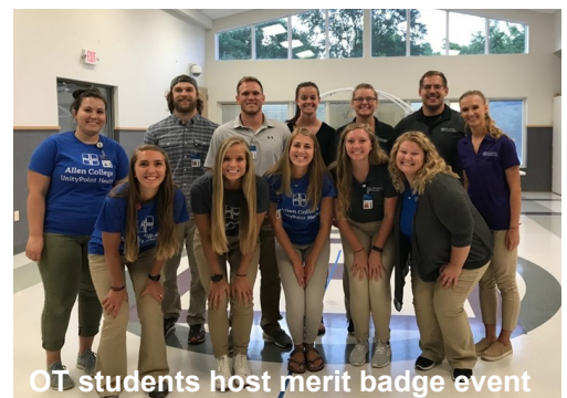
OT students host merit badge event

OT students planned and organized a program for 40 participants from the Boy Scouts of America. The scouts had an opportunity to learn about person first language and through activities explored accessibility, independent living aids and myths/truths about persons with disabilities. The OT program looks forward to a continued community partnership with the Boy Scouts organization.