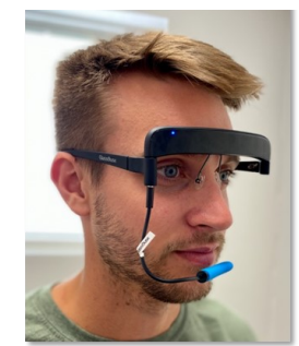
MS in OT student demonstrates use of GlassOuse device to access a computer

These interprofessional events provided opportunities for students to apply classroom knowledge, gain insight from working with members of the community, learn from students in other disciplines and meet the needs of the community.