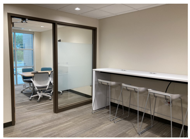
Some of the collaborative spaces and one of the conference rooms are shown in the pictures.