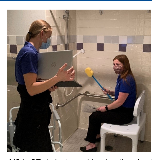
MS in OT students provide education about safe modifications for the bathroom

Second year MS in OT students collaborated with students from the speech language pathology (SLP) program at the University of Northern lowa and the respiratory therapy program at Des Moines Area Community College to provide a virtual caregiver learning lab in March of 2021. Students had the opportunity to advocate for caregivers, provide education and observe interprofessional interventions.