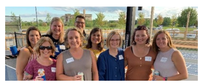
2019 Des Moines Happy Hour